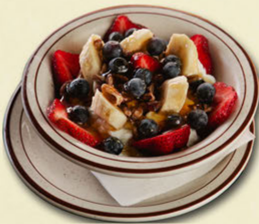
AUTHENTIC GREEK YOGURT TOPPED WITH FRESH STRAWBERRY, BANANA, BLUEBERRIES, PECANS & HONEY...8.95